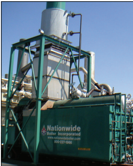
Simple, Safe & Reliable: The E 2 Stak Solution

E 2 Stak is the simple, cost effective solution to meet strict emission requirements, while attaining high operating efficiencies and providing possible energy credit incentives or rebates. Contact Nationwide Boiler today to see how your can reap the benefits of an E 2 Stak solution.