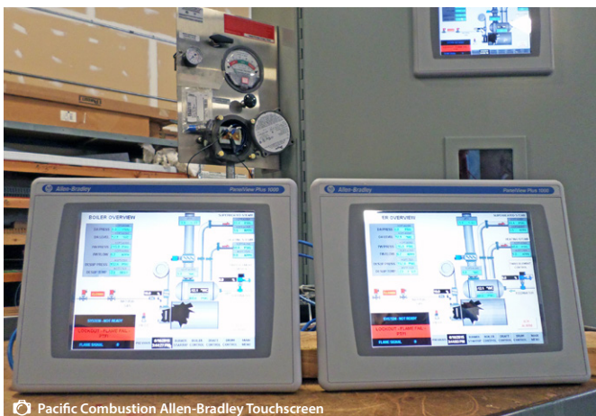
Pacific Combustion Allen-Bradley Touchscreen

“Our industry has been under scrutiny regarding climate change because boilers burn fossil fuels, including oil, gas, and even coal for the very large units. [Today, boilers] are almost exclusively natural gas. Even though that’s a cleaner fuel than coal or oil, it’s still a fossil fuel and adds to climate change. So the pressure to keep producing cleaner and lower emissions is something that our industry is faced with. Fortunately, we are ahead of the curve with our CataStak product. Being in California, versus some of our competitors in other states, I think will serve us well down the road as the regulations continue to change,” says Day. ■