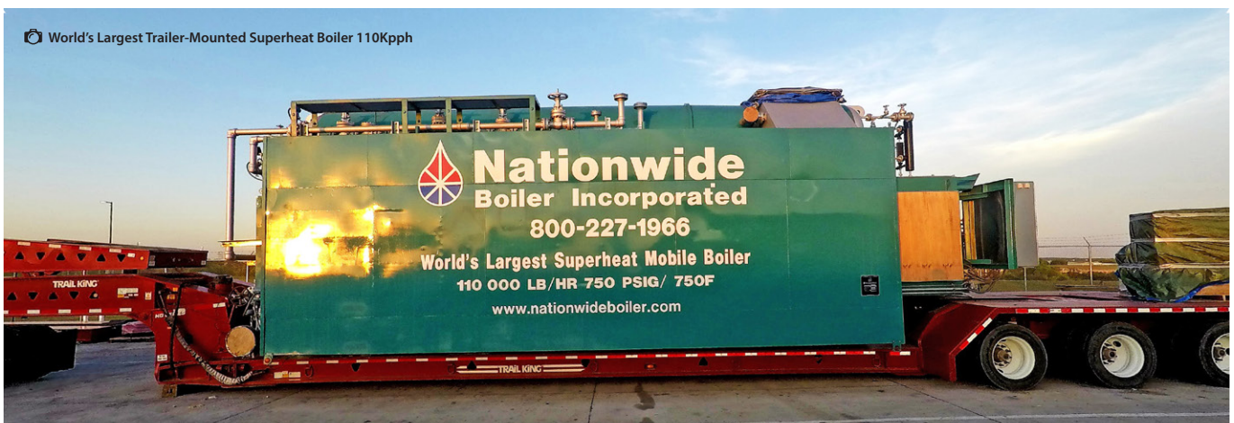
World's Largest Trailer-Mounted Superheat Boiler 110Kpph

"The company's interest in SCR technology stemmed in part from being based in the environmentally-conscious state of California."