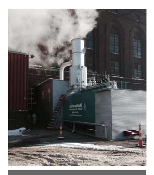
WEATHERPROOF ENCLOSURE Figure 7. This package water tube rental boiler includes a temporary enclosure for temperature conditions at or below freezing.

Finding a supplier with multiple storage locations for its rental equipment