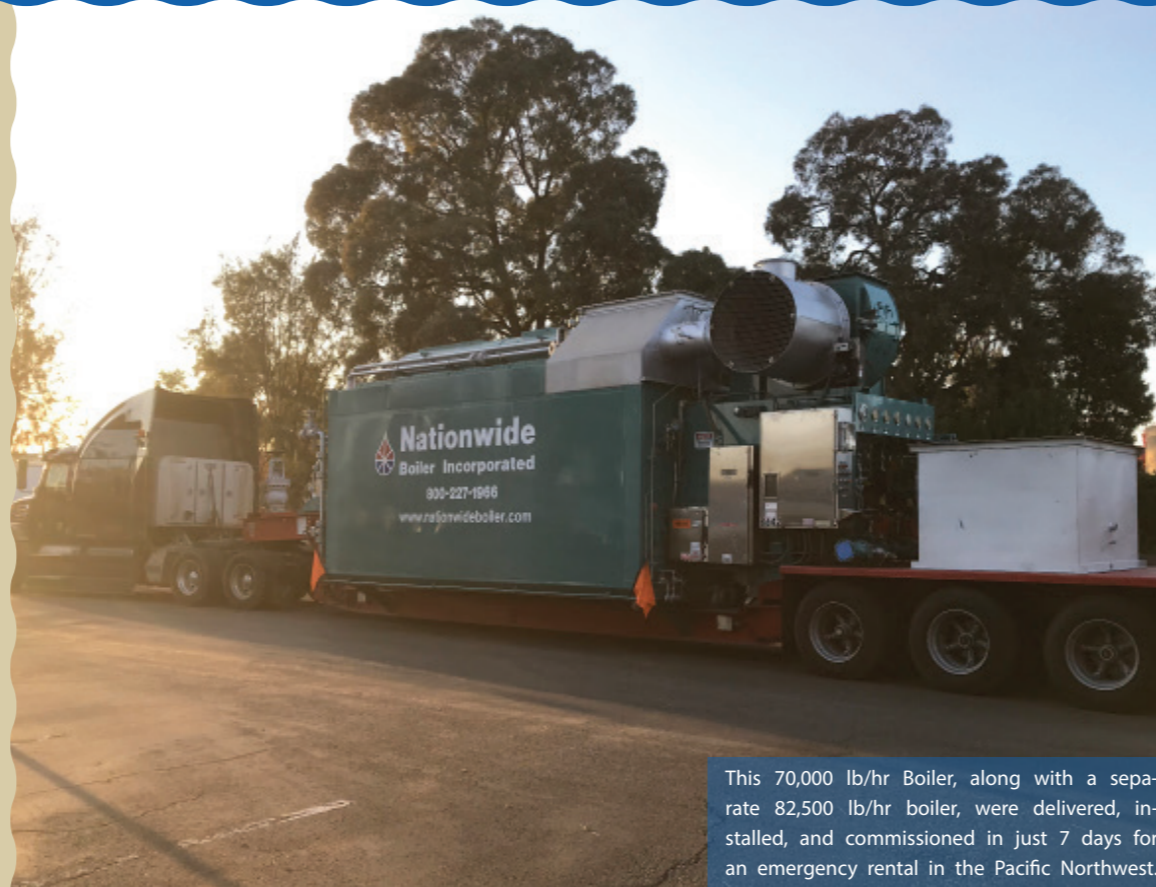
This 70,000 lb/hr Boiler, along with a separate 82,500 lb/hr boiler, were delivered, installed, and commissioned in just 7 days for an emergency rental in the Pacific Northwest.