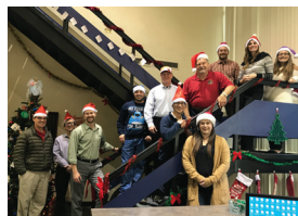
Ugly Christmas Sweater & Santa Hat Days at Nationwide Boiler Headquarters in Fremont, CA