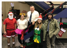
Favorite Flannel and Favorite Christmas Character Days at Nationwide Boiler Headquarters in Fremont, CA