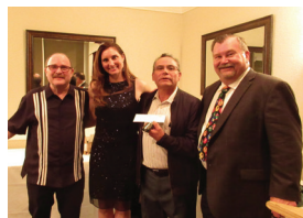
5-year Service Recipients (left), 10-year Service Recipients (right), and 20-year Service Recipient (center)