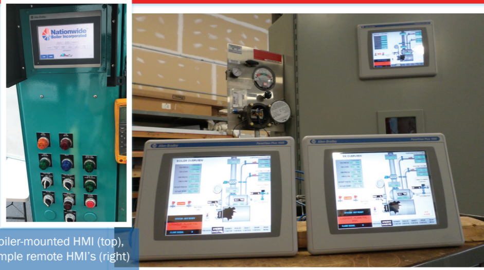
Boiler-mounted HMI (top), sample remote HMI's (right)

A big thanks to GCB for the opportunity to work together on this project. A true example of teamwork with both companies leveraging strengths to solve a problem in our customer's time of need.