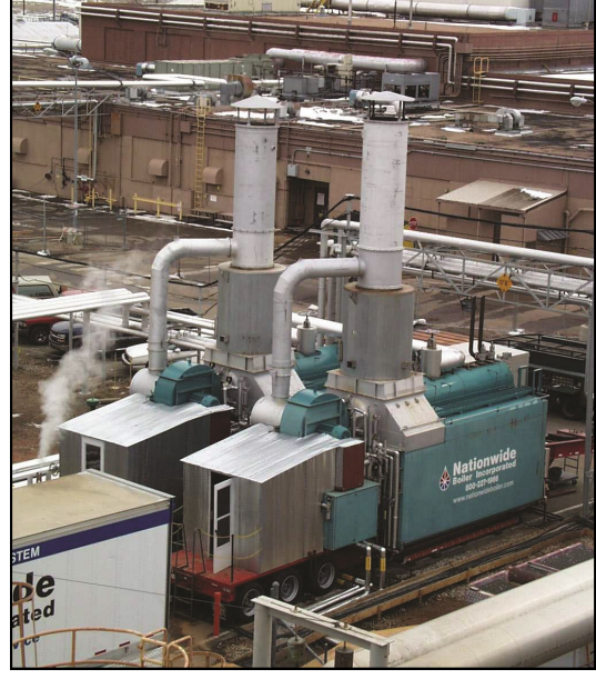
Pictured above: Two (2) Nationwide Boiler 70,000 lb/hr, 300 psig mobile boilers with EconoStak economizers installed for increased fuel efficiency and lower GHG emissions.

Chart below: Typical performance and monthly savings of an EconoStak economizer at varying steam flows.