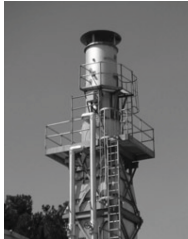
At left, E 2 Stak solution: CataStak™ SCR system and an EconoStak economizer. At bottom, enclosed ammonia safety system.

You can be assured that Nationwide Boiler will meet any tough emission limits and will get the job done, and get it right, the first time.